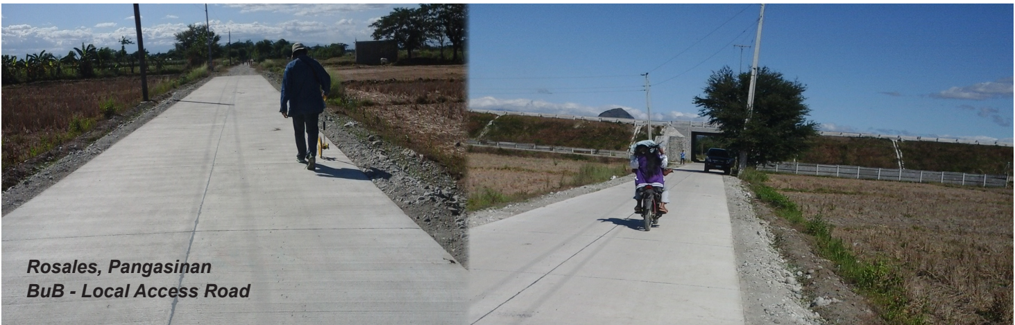
Rosales, Pangasinan BuB - Local Access Road