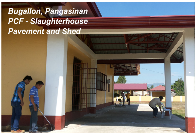
Bugallon, Pangasinan PCF - Slaughterhouse Pavement and Shed