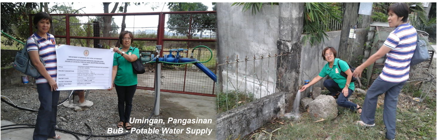
Umingan, Pangasinan BuB - Potable Water Supply

DEPARTMENT OF OFFICIALS AND LOCAL GOVERNMENT ANTI-CORRUPTION PARTICIPATION DIVISION REGIONAL OFFICE REGIONAL OFFICE OF THE ANTI-CORRUPTION DIVISION REGIONAL OFFICE PROJECT: CONSTRUCTION OF A LOCAL WATER SUPPLY FOR THE COMMUNITY PROJECT LOCATION: Umingan, Pangasinan PROJECT COORDINATOR: [Name] PROJECT OFFICER: [Name] PROJECT ASSISTANT: [Name] PROJECT MANAGER: [Name]