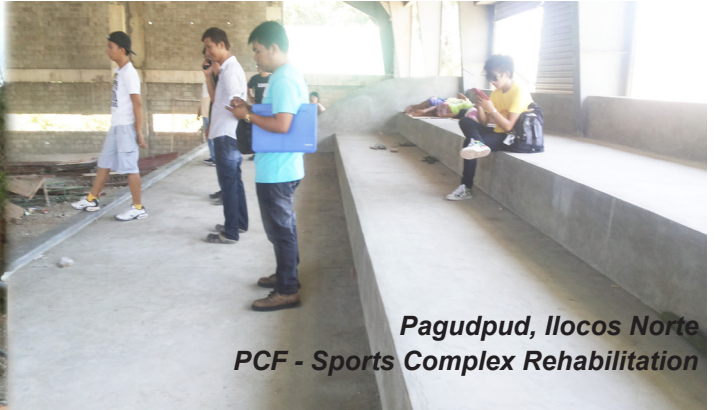
Pagudpud, Ilocos Norte PCF - Sports Complex Rehabilitation