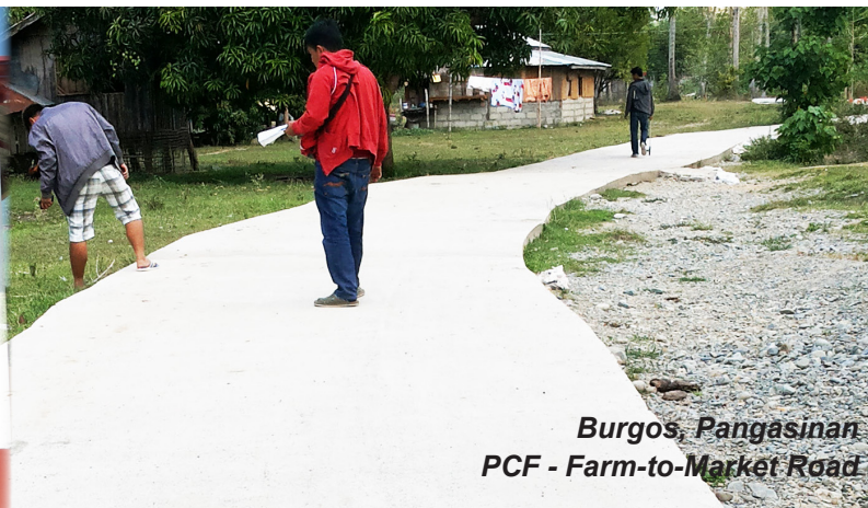
Burgos, Pangasinan PCF - Farm-to-Market Road

As of March 2015, completed 2013 Performance Challenge Fund (PCF) and 2014 Bottom-Up Budgeting (BuB) were as follows: