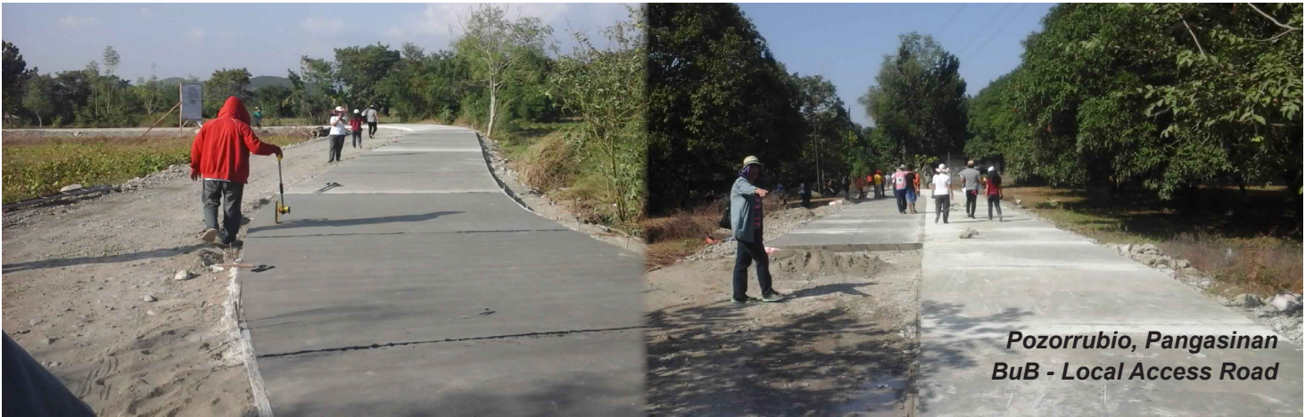
Pozorrubio, Pangasinan BuB - Local Access Road