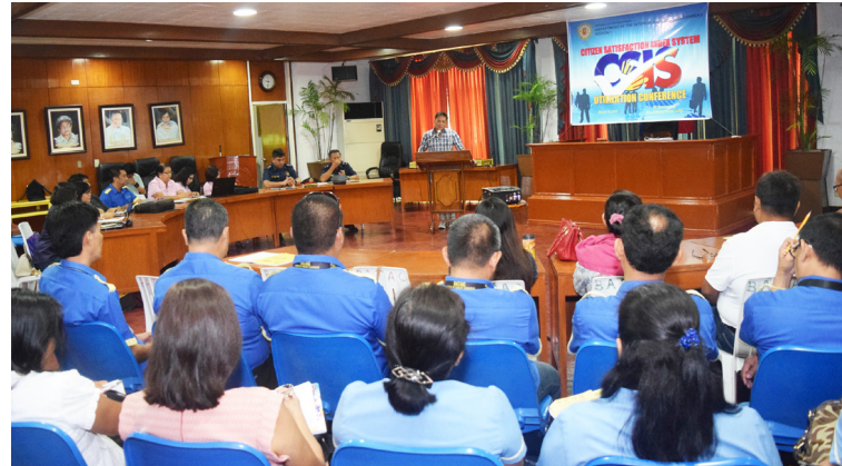
CSIS Utilization Conference - March 10, 2015 Batac City, Ilocos Norte

“As we have known and appreciate the level of awareness and satisfaction and reach of our services to our constituents in the different barangays, we move forward in the consistency of our commitment for continual improvement as we strive to always make the business of governance dynamic. Our sustained efforts to live by our values of transparency, excellence and accountability shall propel us to make use of all the governance tools that we have been utilizing to always reach out to our people”, he said.