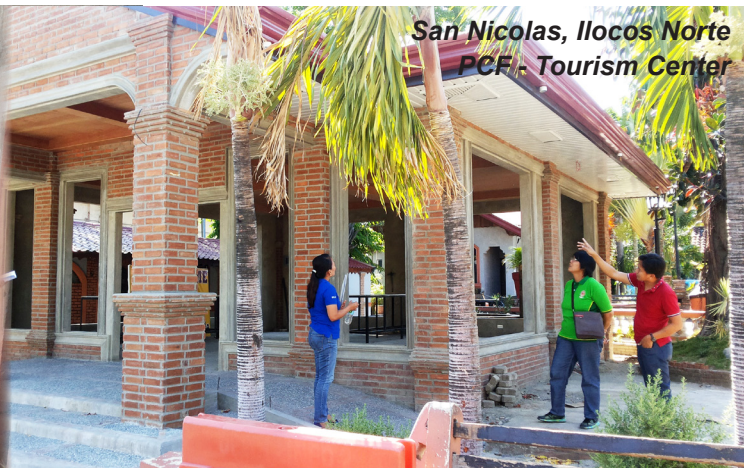
San Nicolas, Ilocos Norte PCF - Tourism Center