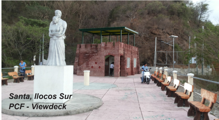
Santa, Ilocos Sur PCF - Viewdeck