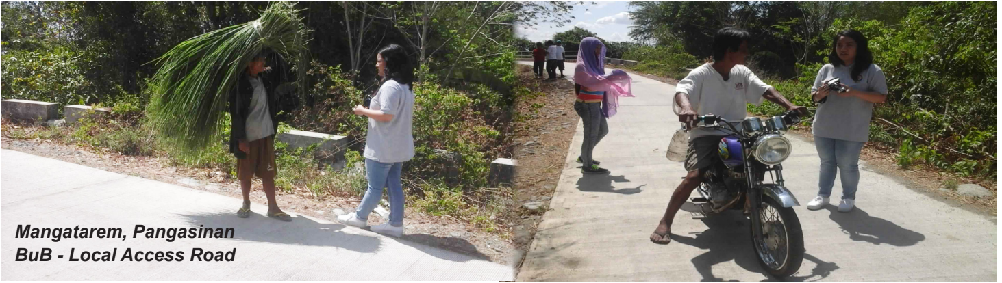
Mangataram, Pangasinan BuB - Local Access Road