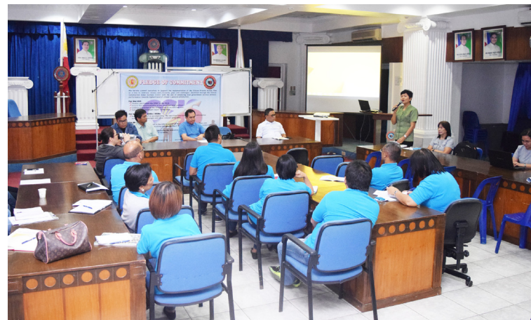
CSIS Utilization Conference - March 31, 2015 City of San Fernando, La Union

The CSIS is a set of data tools designed to collect and generate relevant citizens’ feedback on local governments’ service delivery performance and on the citizens’ general satisfaction. The DILG implements the program by partnering with Local Resource Institutes (LRIs) which are commissioned to conduct the Fieldwork and prepare the Citizen Satisfaction Reports.