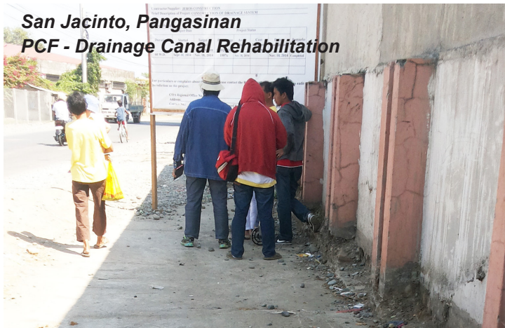
San Jacinto, Pangasinan PCF - Drainage Canal Rehabilitation